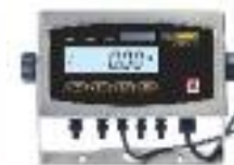
Stainless steel model Scale with T51WXW indicator